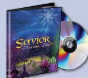
2011 Christmas with Wartburg Savior of the Nations, Come DVD/CD set