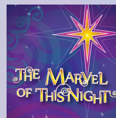
2013 Christmas with Wartburg The Marvel of This Night

Only select albums are available online.