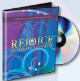
2015 Christmas with Wartburg Rejoice in the Living Water DVD, CD, or digital download