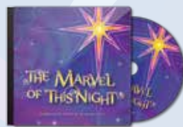
2013 Christmas with Wartburg The Marvel of This Night Digital download only

THE WARTBURG BOOKS | GIFTS | APPAREL STORE