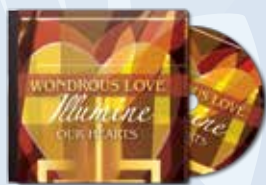
2014 Christmas with Wartburg Wondrous Love Illumine Our Hearts CD or digital download

Only select albums are available online.