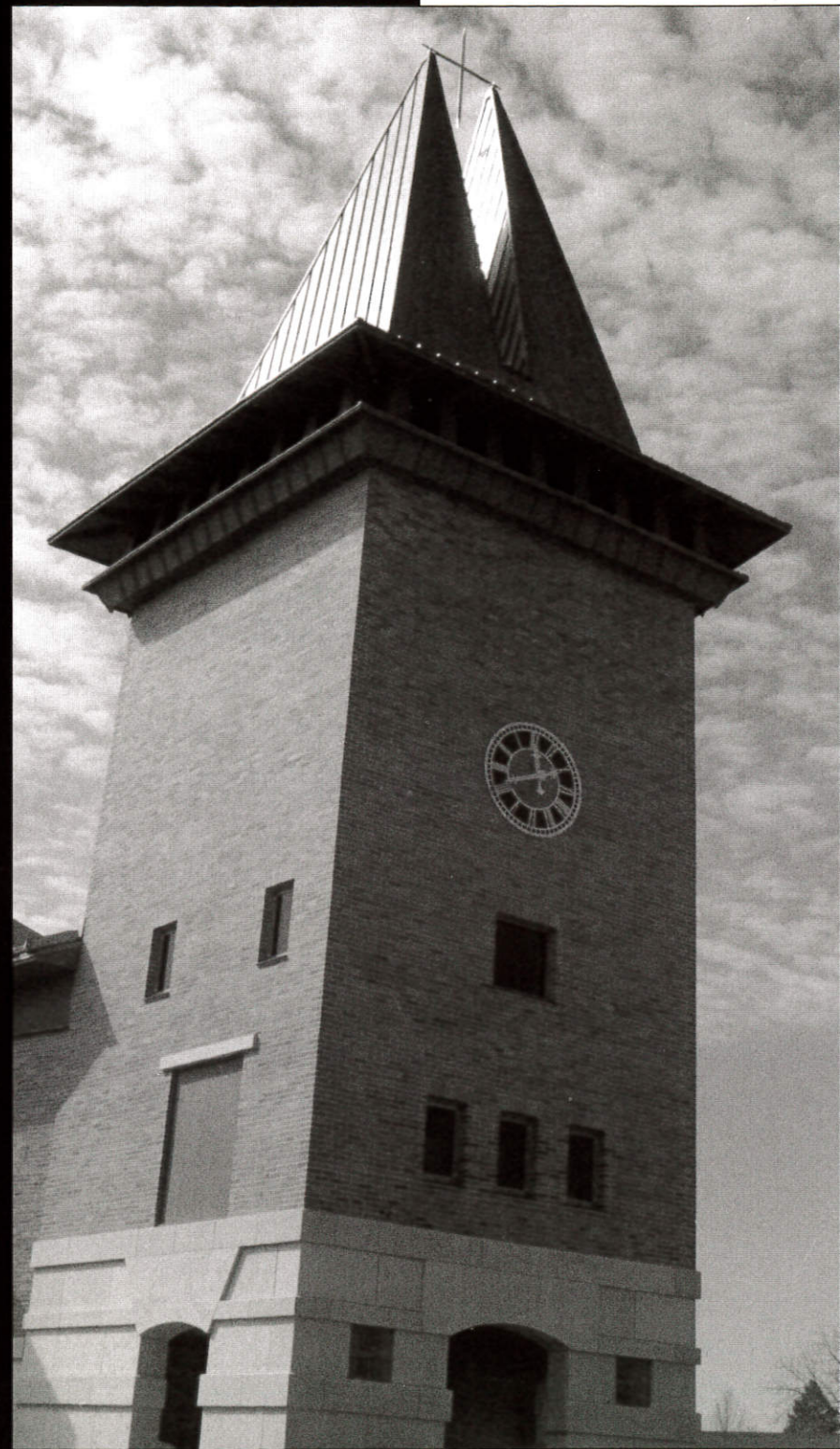
Chapel tower with copper spires, cross, clock, and bells