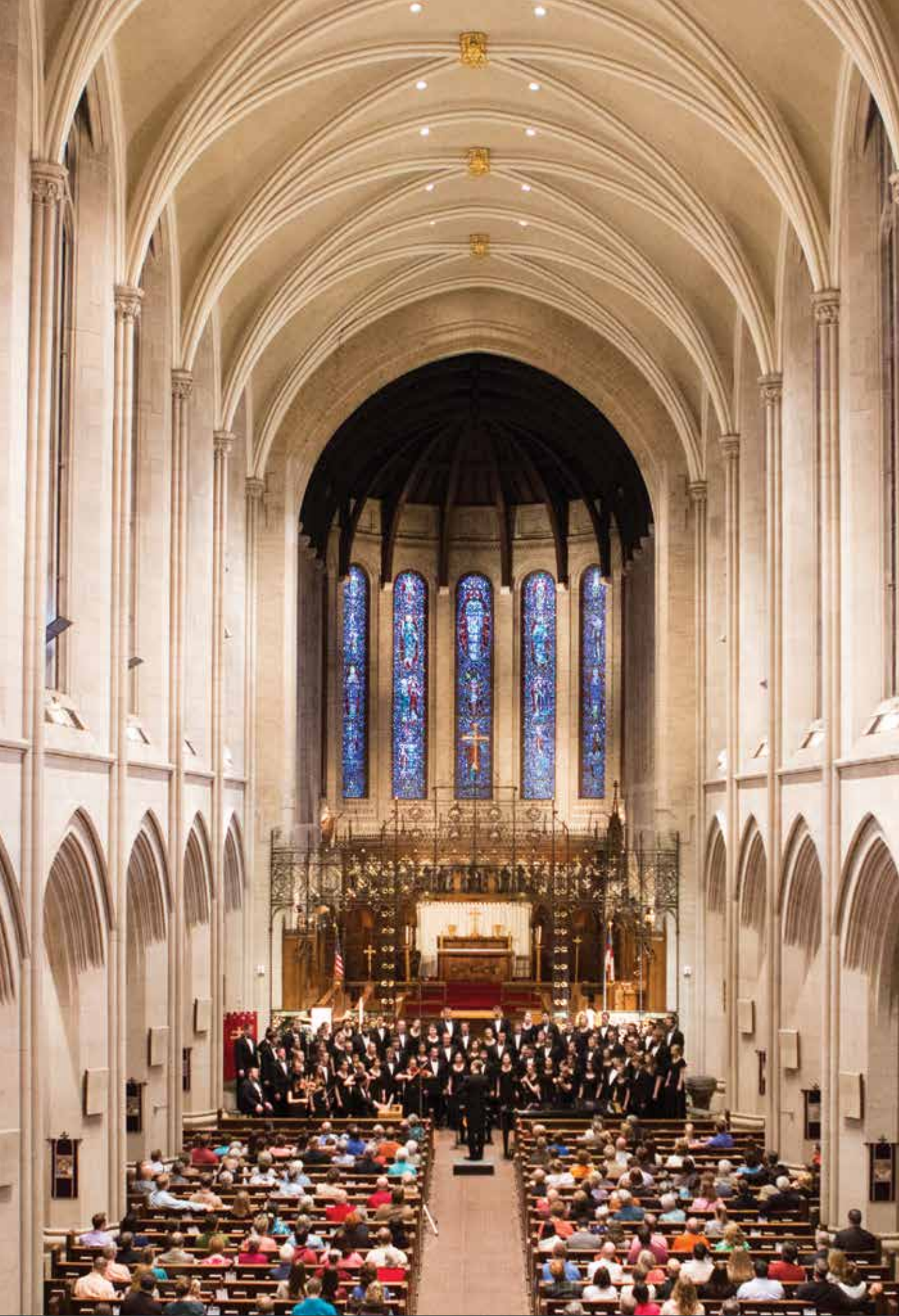
The 2013 Wartburg Choir performs at Saint John's Cathedral in Denver, Colorado. Wartburg College and Saint John's entered into a partnership in that year to permanently move the Wartburg College Urban Studies Program at Wartburg West-Denver to Cathedral Square North.