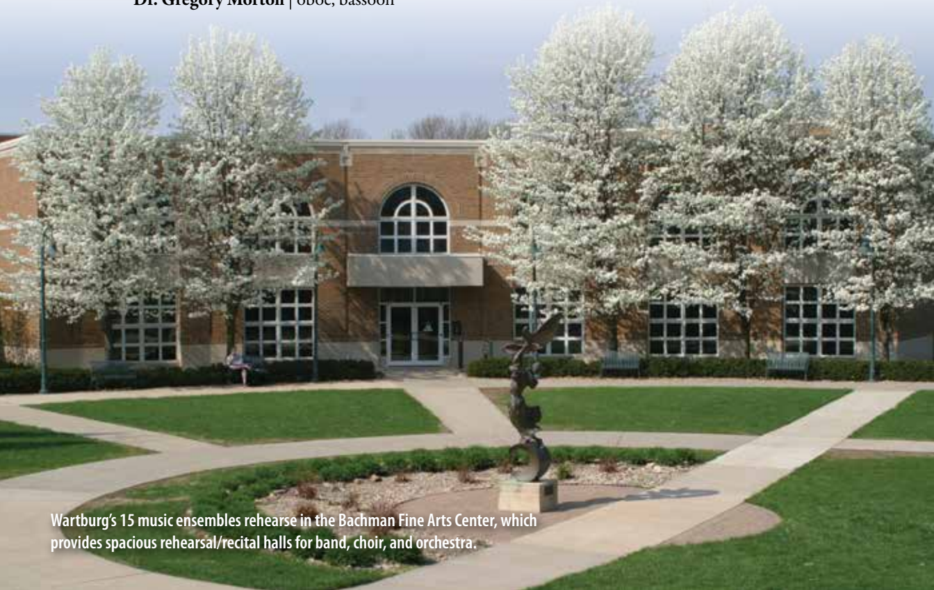
Wartburg's 15 music ensembles rehearse in the Bachman Fine Arts Center, which provides spacious rehearsal/recital halls for band, choir, and orchestra.